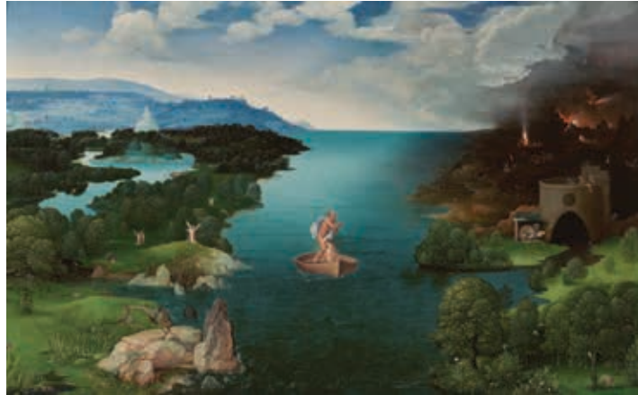
Joachim Patinir Charon crossing the Styx, 1520-1524, oil on panel, 25 x 40 ½ inches, catalogue no. 1616. Madrid, Museo Nacional del Prado.

I think it must be connected just because it is so similar. I went to art school, so I didn't have a lot of literature courses. I didn't study it. But I remember finding a book by Gregory Corso. I think it was printed in his