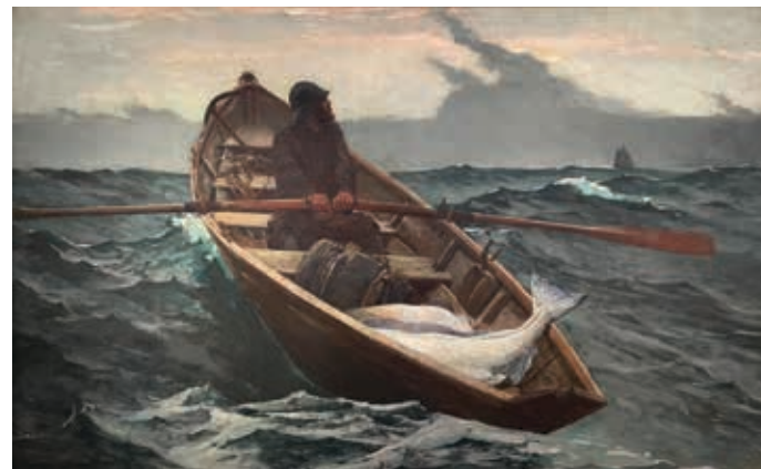
Winslow Homer The Fog Warning , 1885, Oil on canvas, 30 ¼ x 48 ½ inches, Image courtesy: © 2023 Museum of Fine Arts, Boston.