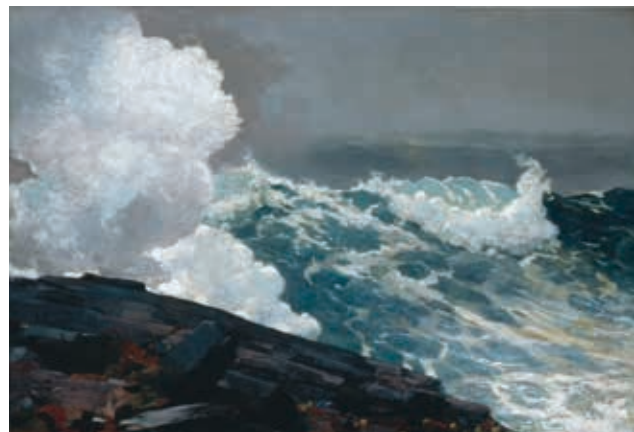
Winslow Homer Northeaster , 1895, Oil on canvas, 34 ½ x 50 inches, Image courtesy: © The Metropolitan Museum of Art / Art Resource, NY.

In a boat. I know, it's horrible. My mom, who is ninety—I showed her the paintings, and she was like, "The dog's alone; how's he going to get back?" I said, "You got it. That's exactly it."