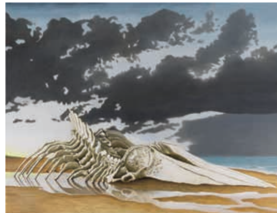
Sean Landers Sperm Whale Skeleton II , 2023 Oil on linen 70 x 92 inches

crux of being an artist is asking for that love from the world.