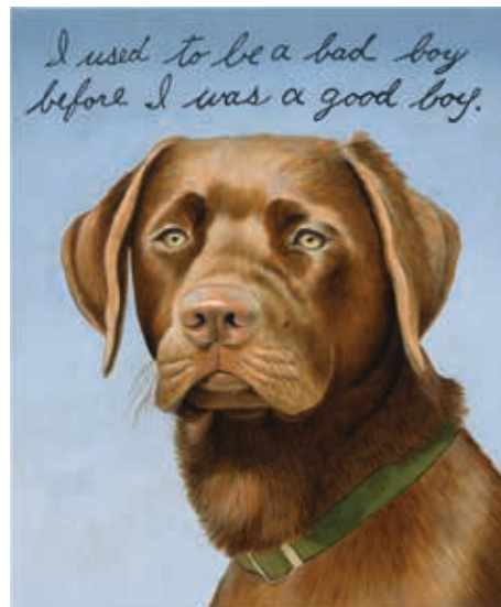
Sean Landers Dog , 2021 Oil on linen 34 x 28 inches

. . . because the subject resembles a painting from a Cape Cod gift shop—just a really big version.