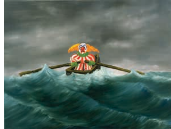
Sean Landers Alone , 1996 Oil on linen 72 x 96 inches

Were they laughing with me or at me? First, it was at . By the time I started exhibiting, when galleries were willing to show this stuff, I was way more in control.