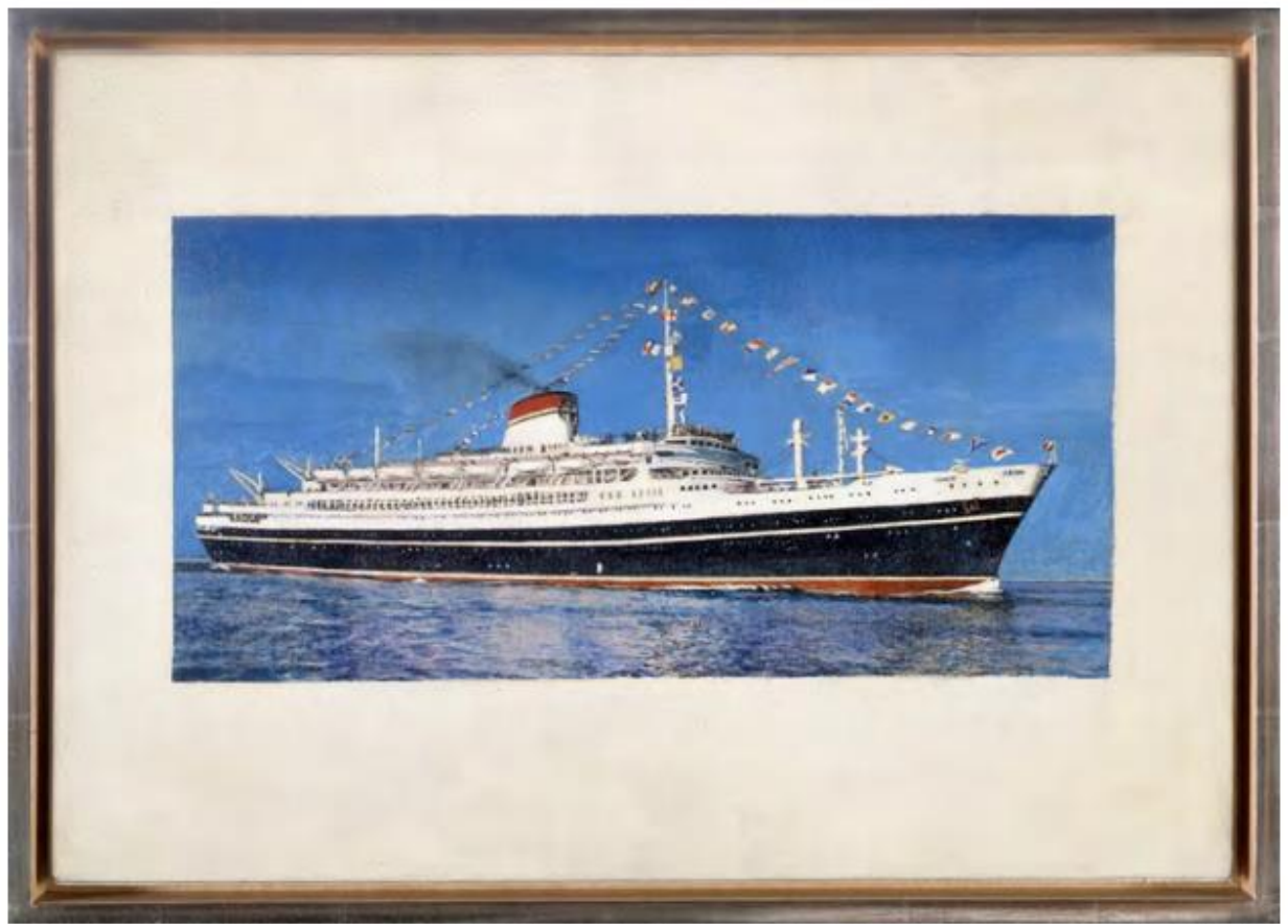
Malcolm Morley, Cristoforo Colombo, 1966. Liquitex on canvas, 14 × 20 inches. Private collection.

"In Memoriam: A Tribute to Malcolm Morley." The Brooklyn Rail. August 3, 2018.