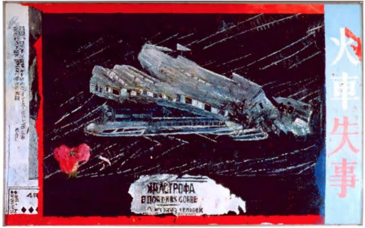
Malcolm Morley, Train Wreck, 1976. Oil on canvas, 60 × 96 inches. Museum Moderne Kunst/Ludwig Foundation, Vienna.

"In Memoriam: A Tribute to Malcolm Morley." The Brooklyn Rail. August 3, 2018.