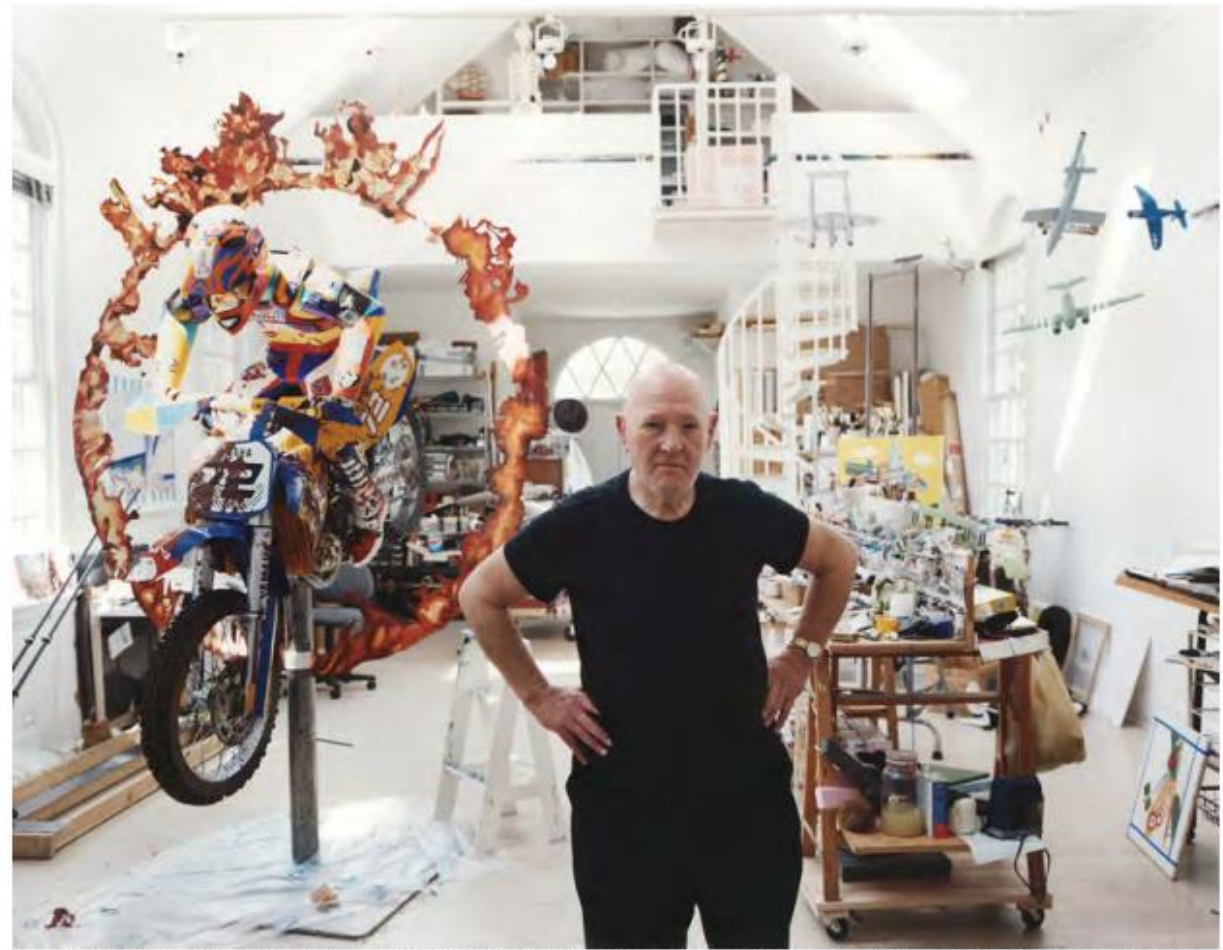
Malcolm Morley in his studio in Bellport, New York, in 2009.

Greece, July 2018. It was hot. I was sitting in the Pirate Bar in Hydra, looking at the boats. One with an electric blue stripe on a red hull. Another caique painted a dull dark blue with a feeble yellow stripe. The white crests of water from speedboats, wakes crisscrossing, when we had earlier arrived by ferry from Metochi: all of it was Malcolm.